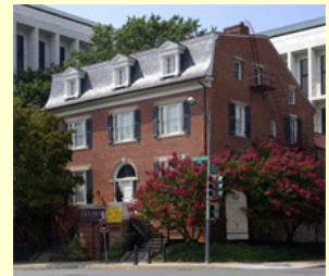
The Sewall-Belmont House was home to Suffragist Alice Paul. Now also a museum, the house is slated to re-open this year, and our unit plans to visit.

Monthly—Board Meeting (open to members and guests) August—Summer Workshop in Hampton October—Open House Reception (open to the community) October through April—Registering voters at area high schools November—General Meeting December—Tour of the Sewall-Belmont House, Washington, DC December—Women’s Round Table in Richmond February— One Woman, One Vote film showing March—Part 2 Election Study Consensus April—Virginia LWV convention in Blacksburg May—Annual meeting and election of officers